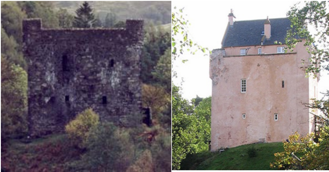
Kinlochaline Castle before and after restoration.

Do hope to see y'all soon. Until then, have a wonderful summer, or at least what's left of it. Closing our pool in a couple days – always a sign that “Winter is Coming”!