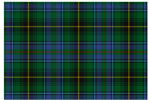
MacInnes Onich Tartan

This Scottish heritage national observance originated in Canada in the 1980s. Nova Scotia was the first to formally recognize April 6 in 1987, choosing that date because the Declaration of Arbroath was signed April 6, 1320 – the document sent by Scottish nobles to the Pope declaring Scotland’s independence from England. Canada made April 6 official in December 1991.